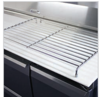
Wire rod garnish rack