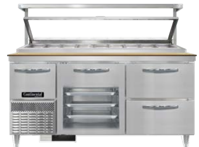
16-Gauge Overshelves (single or double)