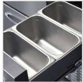
Drawer in lieu of door above the condensing unit