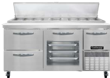
2-Tier Drawers & Pan Slides (door removed for viewing purposes)