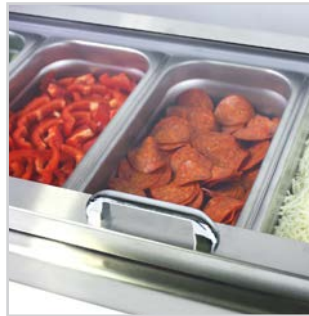
Vision panel lid