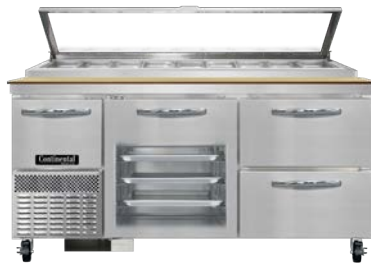
Vision Panel Lid & Front Breathing